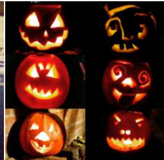
1 and 2. Acton Carnival 3. Salad Day 4. Picnic at Battersea Park and triking 5. Halloween pumpkins